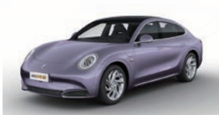
ORA Lightning Cat

ORA Lightning Cat is a new-generation new energy vehicle created by Great Wall Motor based on global R&D, supporting and manufacturing standards and systems. It will be available in a number of countries and regions including China, EU and ASEAN. Being good-looking, high-performance, highly smart and female-friendly, ORA Lightning Cat will deliver an excellent product experience to users.