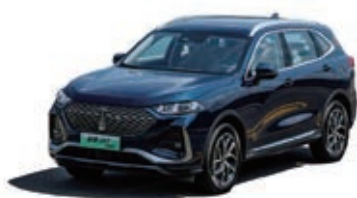
WEY Latte DHT-PHEV

Mocha DHT-PHEV is the first flagship model of WEY under the new category of “smart electric vehicles with zero anxiety”, and is also a cross-generational product that disrupts the new energy vehicle market. The new model, which is made up of a highly integrated intelligent DHT system, a series of COFFEE Intelligence features, and a range of luxury, high-tech functions, hits the high-end new energy vehicle market. It brings users a new set of “zero-anxiety” travel solutions with “zero range anxiety, zero intelligence anxiety, and zero performance anxiety”.