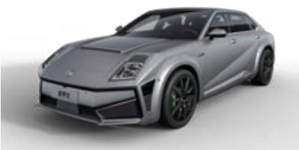
Saloon Mecha Dragon

ORA Punk Cat is a new flagship model of ORA with the design concept of “classic retro aesthetics”. It integrates retro art and light luxury technology, and consolidates its core competitiveness by delivering an exquisite, artistic and emotional car-owning experience. Its overall appearance adopts circular design elements to fully embody the design concept of classic retro. The interior adopts the triple-screen design and a new emotional cockpit system to bring users a warm driving experience. The interior also has multi-color rhythmic atmosphere lights, electroplating and crystal texture decoration, and details in relief, which, coupled with the design concept for appearance, highlight an exquisite artistic beauty. Punk Cat is created as a “mobile artwork” to promote the development of the ORA brand.