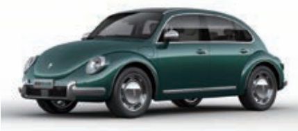
ORA Punk Cat

ORA Lightning Cat is a new-generation new energy vehicle created by Great Wall Motor based on global R&D, supporting and manufacturing standards and systems. It will be available in a number of countries and regions including China, EU and ASEAN. Being good-looking, high-performance, highly smart and female-friendly, ORA Lightning Cat will deliver an excellent product experience to users.