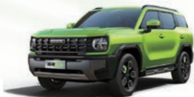
Haval Cool Dog

As a three-quarter cool car for the “daring youth”, Haval Cool Dog is the second model of the Dog series. It has been available since 10 August 2022. Starting as a Haval X DOG concept car, the new model, embedded with co-creation DNA, is a stylish and cool car co-created with many young users to best meet their needs, thus opening a new chapter for user co-creation.