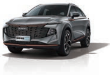
Haval Beast DHT

As the first model of the TANK brand's business luxury series, Tank 500 is positioned as a medium-to-large business luxury SUV. With the strong powertrain of 3.0T V6 + 9AT and strong product strength, it can deliver a supreme driving experience of the kind seen in a RMB1 million car to break the cost-effective ceiling, and will become a role model among medium-to-large luxury off-road SUVs in the world.