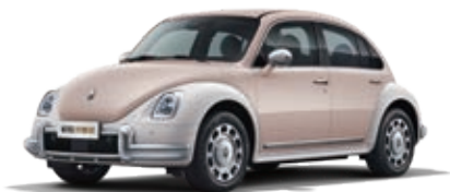
ORA Ballet Cat

As a new member of the "new technology flagship SUV" club, Haval Beast Hybrid DHT will challenge the traditional alliance of giants in the hybrid market with the technological advantages of "full speed range & all scenarios, high efficiency & high performance", so as to give the public a clearer picture of Haval's technological strengths in the hybrid field and the product vision of "making hybrid more than fuel-efficient from now on".