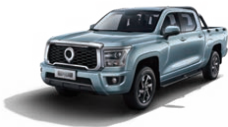
King Kong Cannon

Latte DHT-PHEV is another blockbuster model of WEY under its shift to high-end new energy vehicles. Its two-wheel drive version has a pure electric range of 184km, a combined fuel consumption of 0.48L/100km, a fuel consumption of 5.4L/100km when the battery is low, and a combined range of over 1,000km. It mainly targets the new generation of families. Based on the brand’s two core technologies – intelligent DHT series-parallel technology and COFFEE Intelligence, it takes the lead in proposing the development and design concept of being family-friendly and child-friendly, and sets new standards for “family cars” with 26 child-friendly functions in all dimensions.