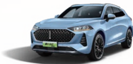
WEY Mocha DHT-PHEV

Mocha DHT-PHEV is the first flagship model of WEY under the new category of “smart electric vehicles with zero anxiety”, and is also a cross-generational product that disrupts the new energy vehicle market. The new model, which is made up of a highly integrated intelligent DHT system, a series of COFFEE Intelligence features, and a range of luxury, high-tech functions, hits the high-end new energy vehicle market. It brings users a new set of “zero-anxiety” travel solutions with “zero range anxiety, zero intelligence anxiety, and zero performance anxiety”.